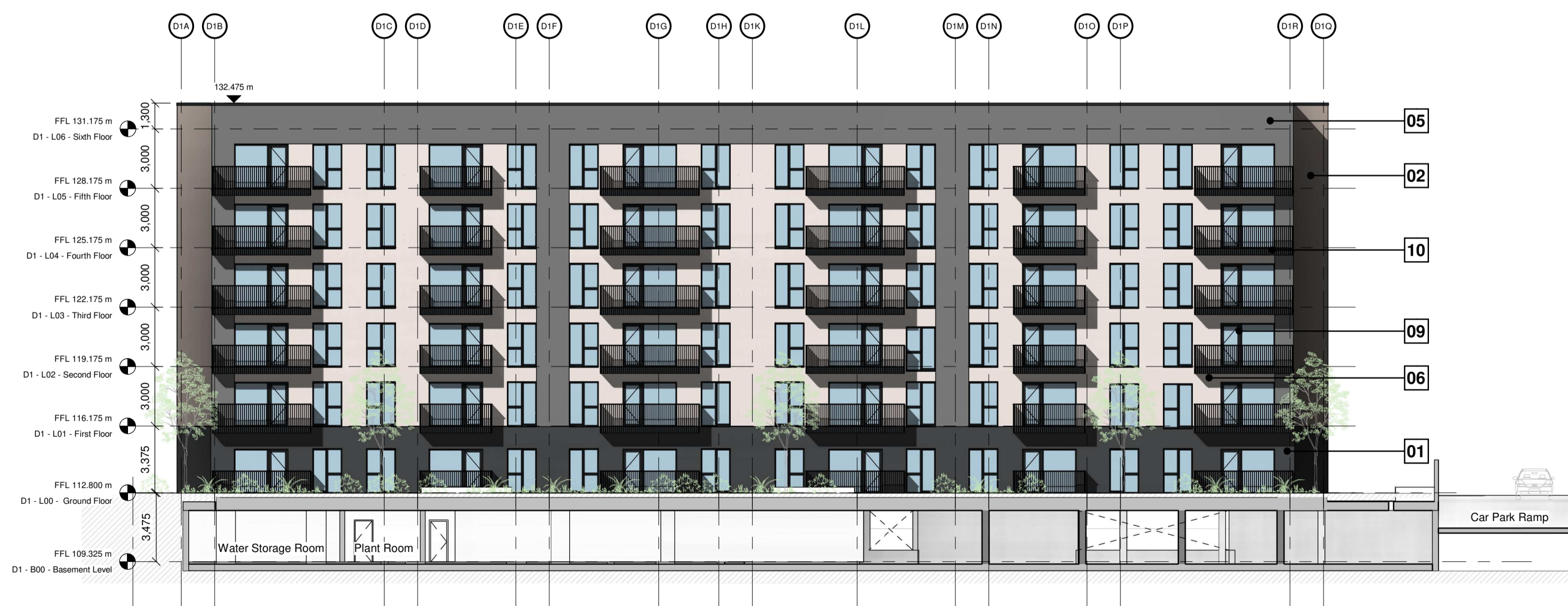
3 PROPOSED ELEVATION - Block D1 - WEST 1 : 200