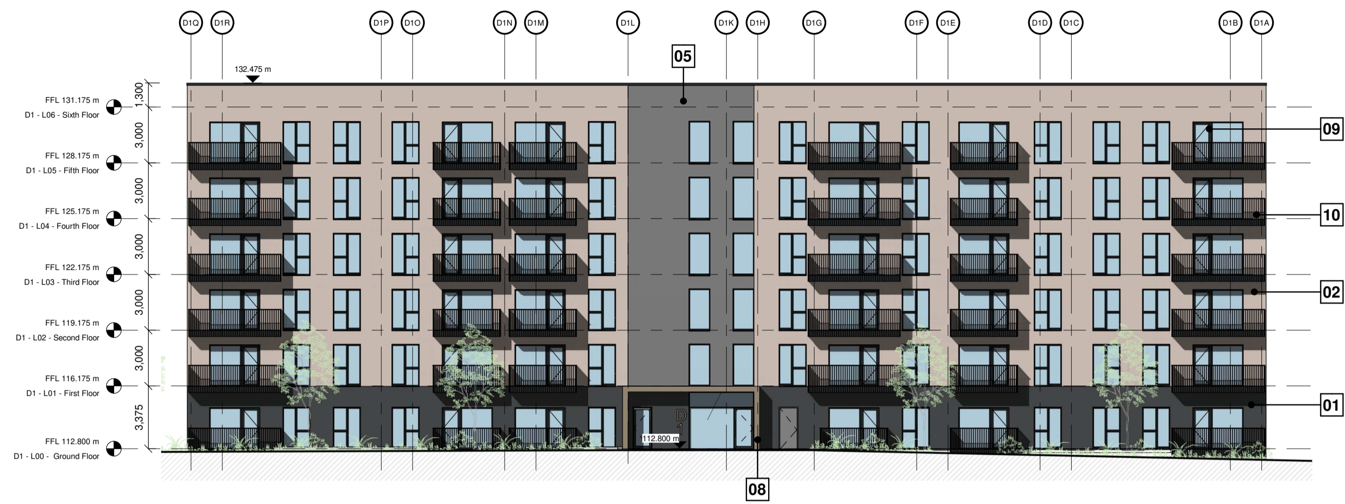
1 PROPOSED ELEVATION - BLOCK D1 - EAST 1 : 200