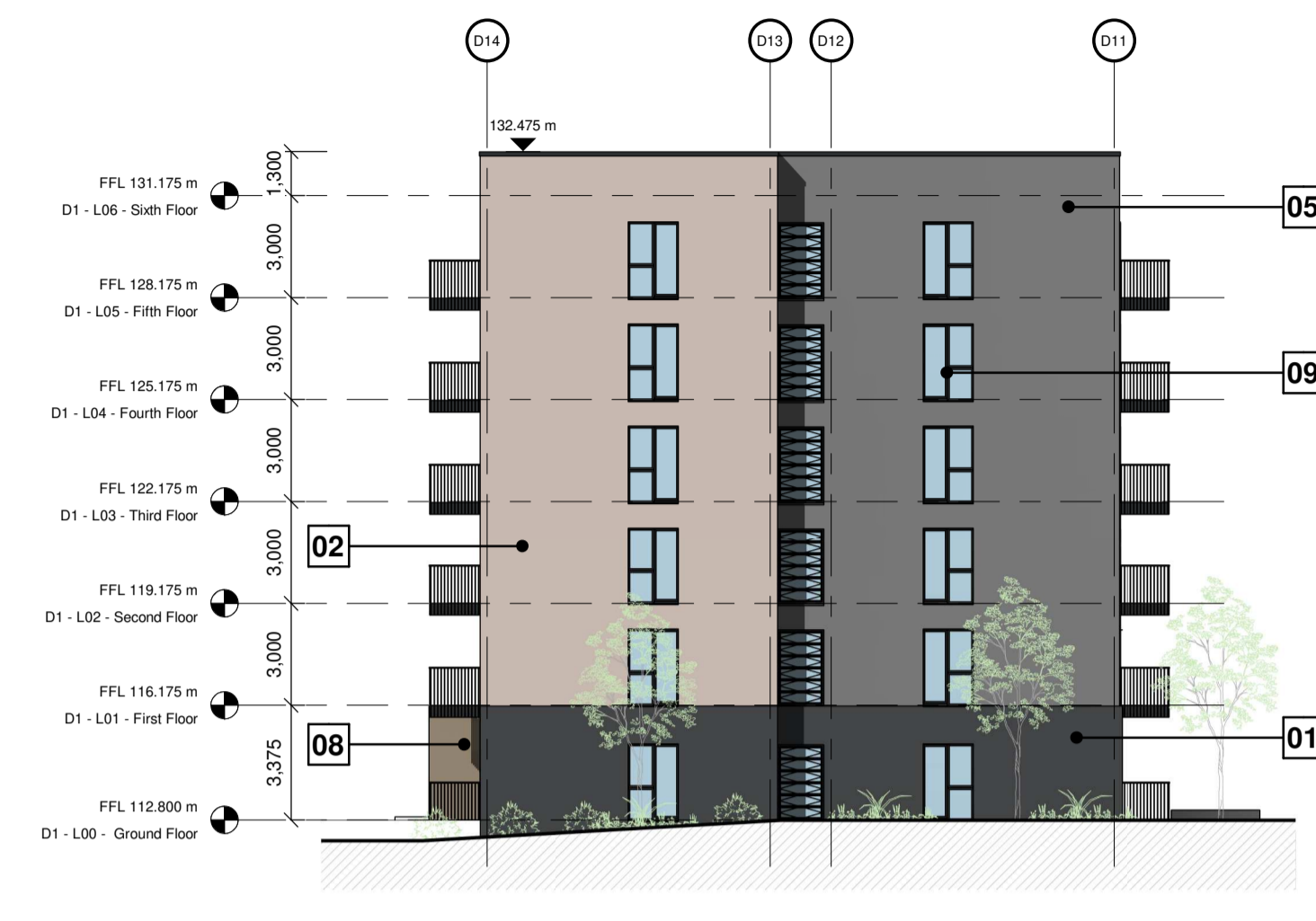
2 PROPOSED ELEVATION - Block D1 - NORTH 1 : 200