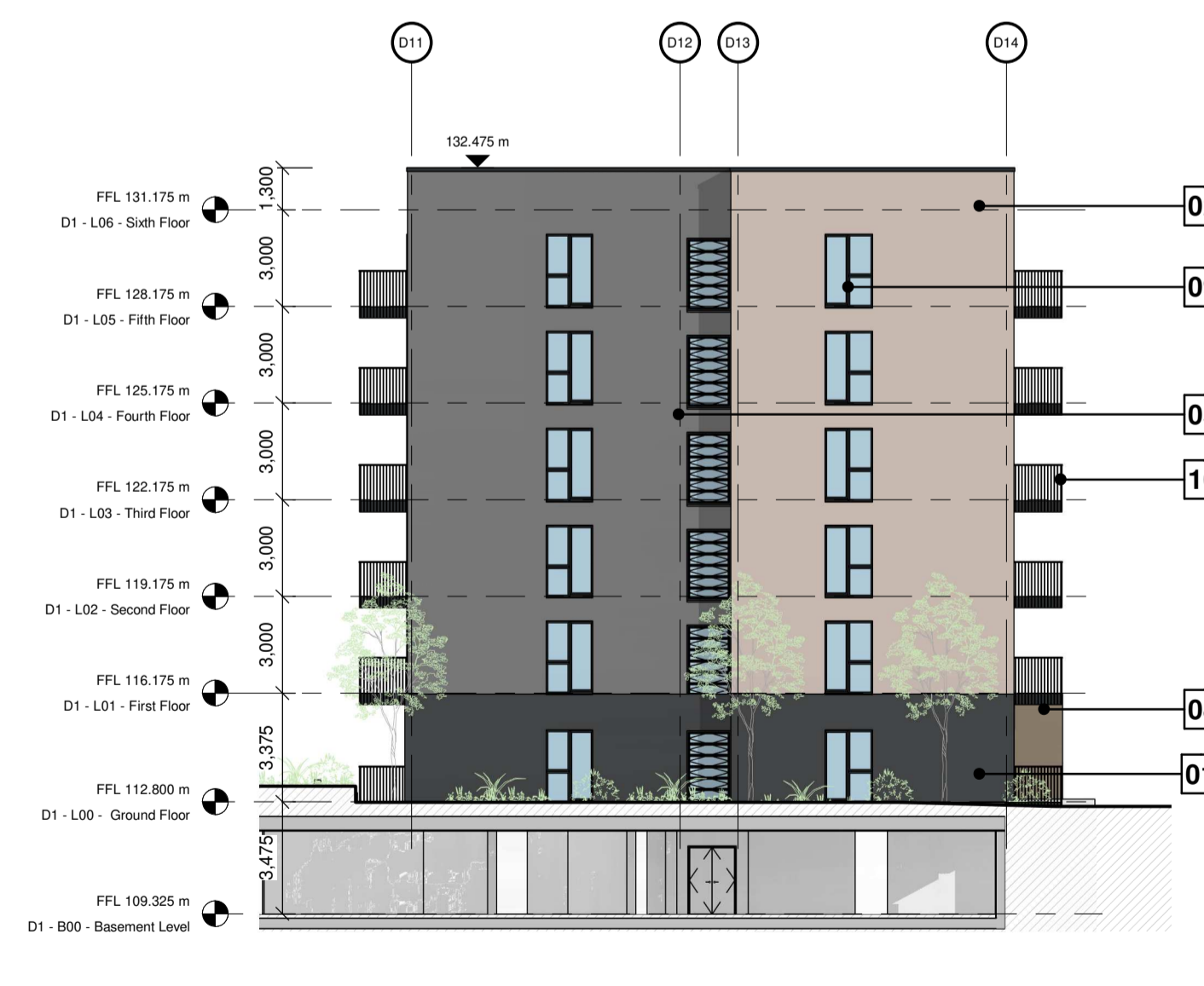
4 PROPOSED ELEVATION - Block D1 - SOUTH 1 : 200

Notes: - Do not scale from this drawing. Use figured dimensions in all cases. - Verify dimensions on site and report any discrepancies to the Architect immediately. - This drawing is to be read in conjunction with the Architect's Specification. - © This drawing is copyright and may only be reproduced with the Architect's permission.